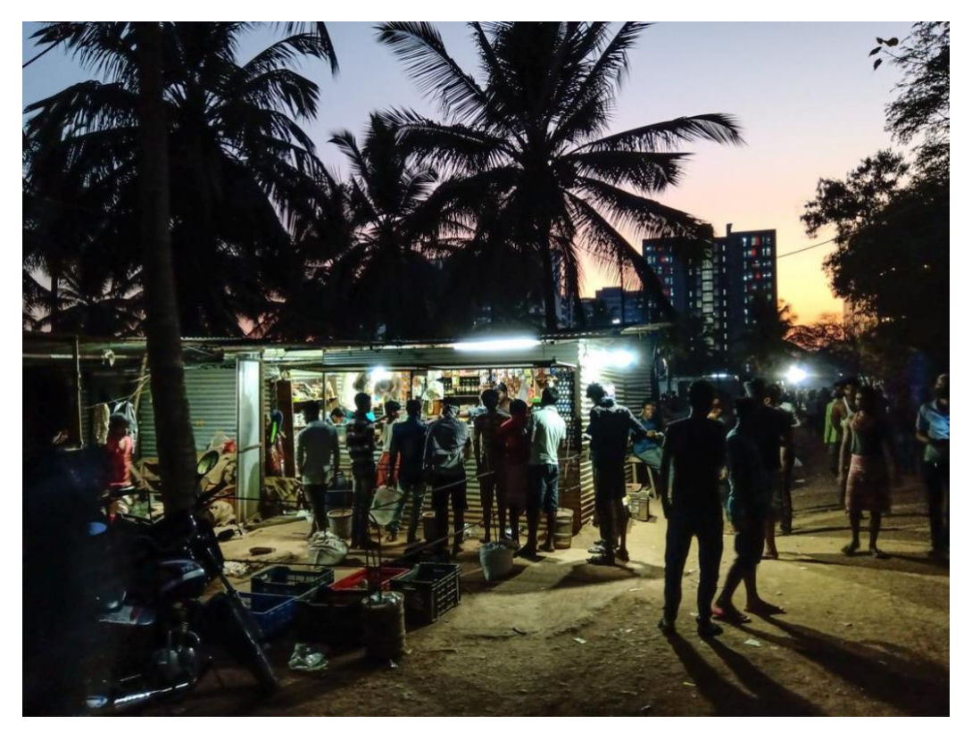
Ration shop at the ITPL colony which supplies ration to roughly 2000 workers from two colonies in that area.