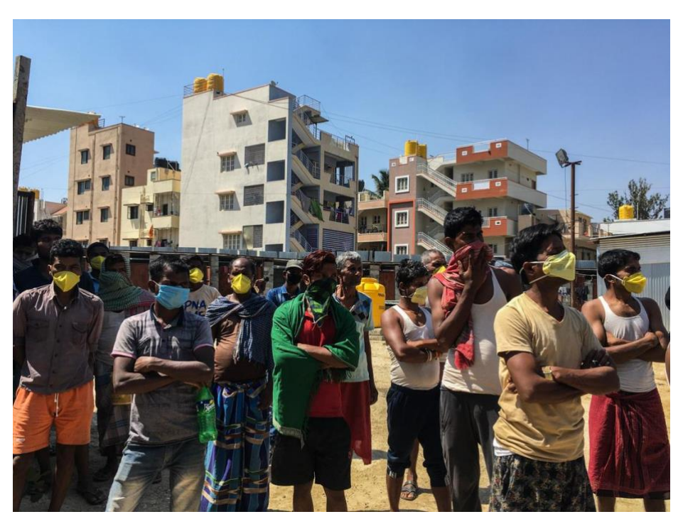
"There is barely any money left to send home. How will our family members eat?