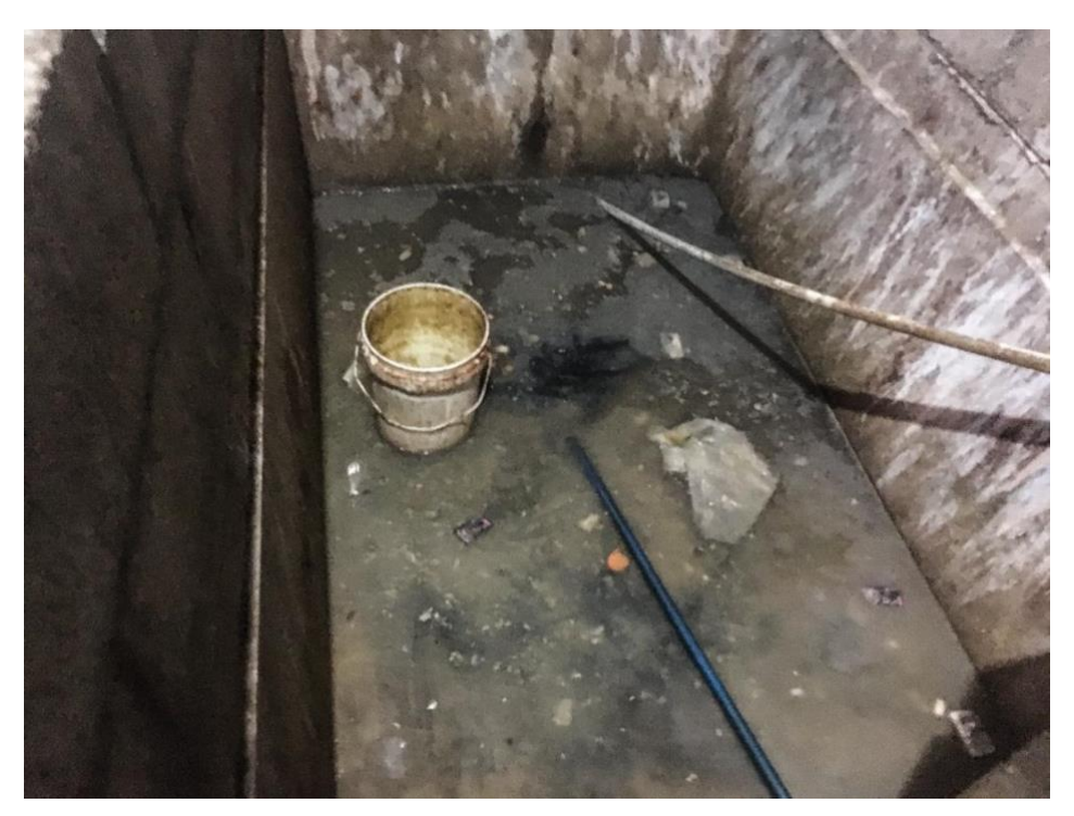
The bathroom is clogged for several days now. It is practically unusable. There are only two bathrooms in this colony.