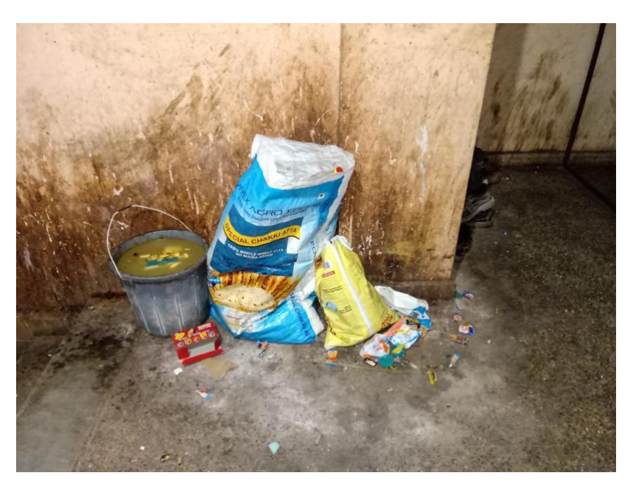
Garbage has not been cleaned for two weeks from the colony. There is no place to dispose of garbage, so it piles up by the staircase of each floor.

"I paid Rs.20,000 as deposit and Rs 6,000 as rent. In-spite of this, my room owner has evicted me, because I am unable to pay rent because of the lockdown. He has locked my room, my cooking utensils, clothes and documents are inside. He refuses to open it, unless I pay him an additional Rs. 8,000. Where will I get this money from? I am living with other workers in their rooms, in the labour colony. I have no clothes. I have been wearing the same shirt and shorts since the day the lockdown began," said a worker from the labour colony in Kudlu Gate