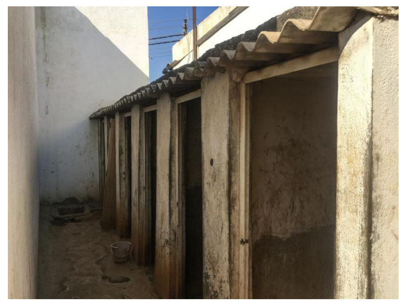
Bathrooms do not have doors. Of the four bathrooms, only two are functional. The rest are clogged and have not been cleaned in months. This has to be shared between 200 workers.