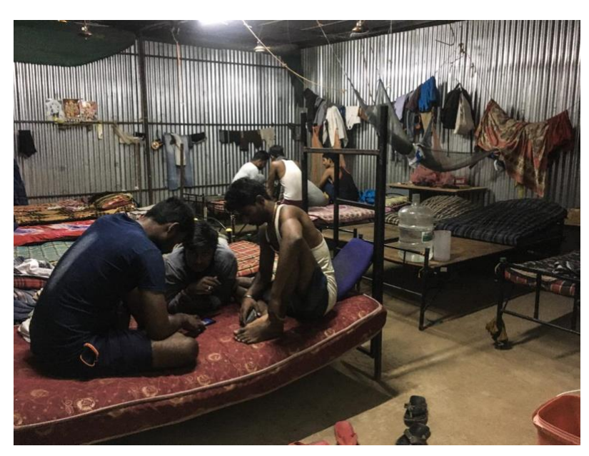
During the lockdown, workers are crammed in tin sheets rooms that absorb heat. There are no fans in the labour colonies. The workers also complained of