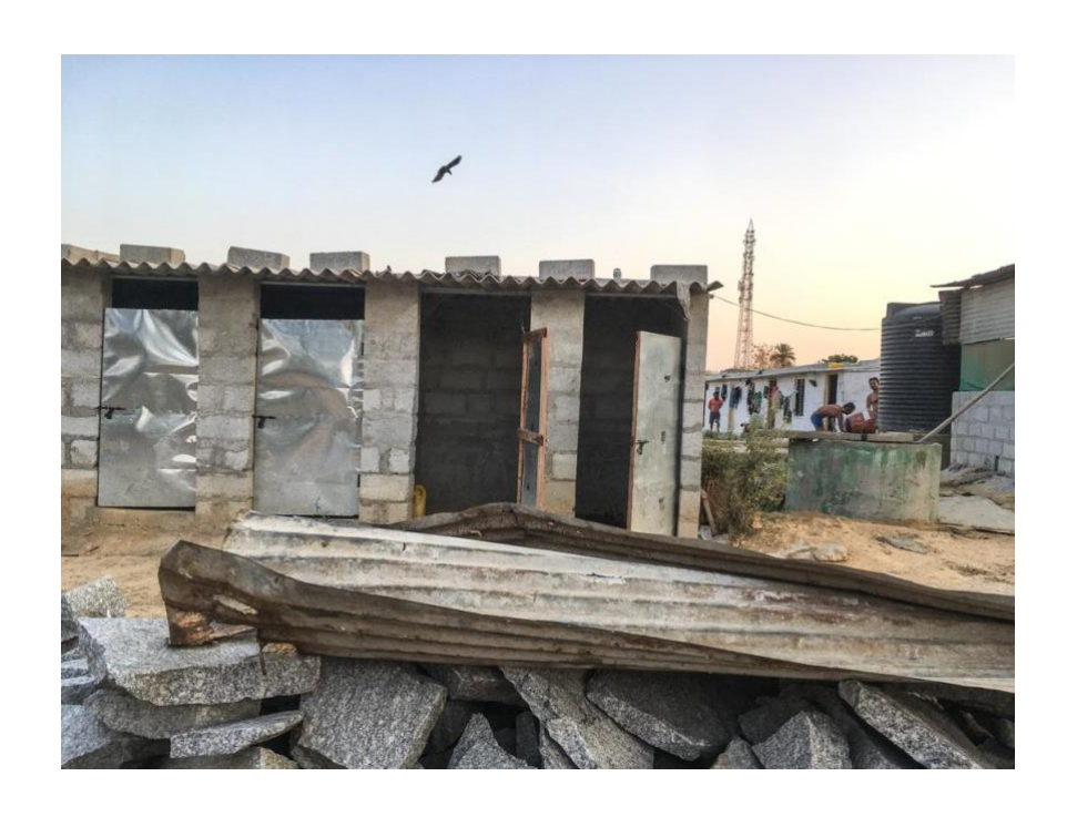
Only two of the bathrooms are functioning in this labour colony. The other two are soiled and dirty. 200 workers have to share these common toilets.