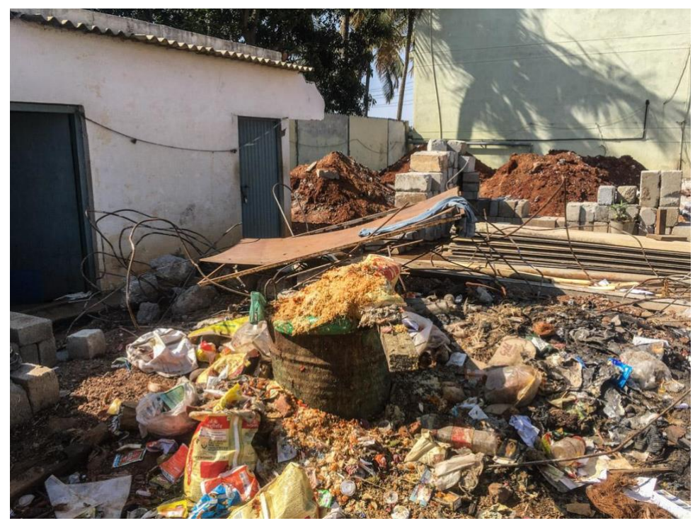
Outside the workers houses lies sewage and stagnant water from the drain. On one side lies an open garbage dump that has not been cleaned.