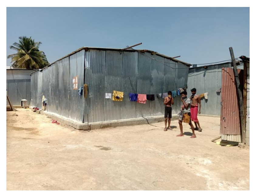
"Our rooms are very small. There are no fans, and these days it is very hot. The sun heats up the tin. We feel like we will catch fire inside. There is no space to step out, just for some fresh air."