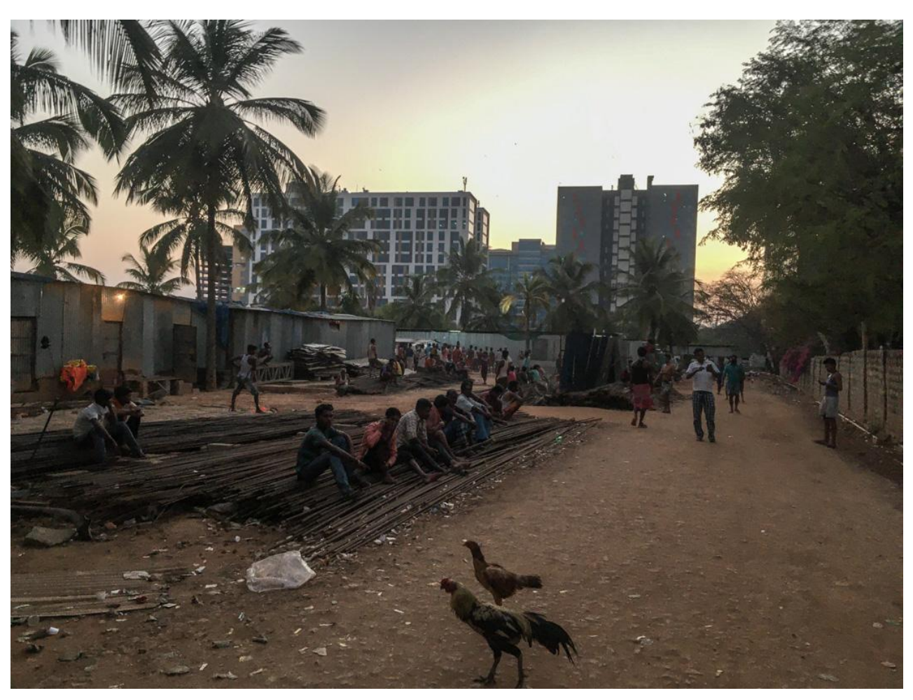
At the labour Colony on ECC Main road, ITPL where about 100 workers reside from different parts of North and Central India, one of the workers said, "The contractor sent 2 kilos of rice, potatoes and onions a few days after the lockdown. After this, he has not picked up their calls. The problem with contractors is that they wont let us live, or die. The real illness is the inability to work." 300 construct worker building the Brigade towers live beside the labour colony. Similar problems persists with them too.