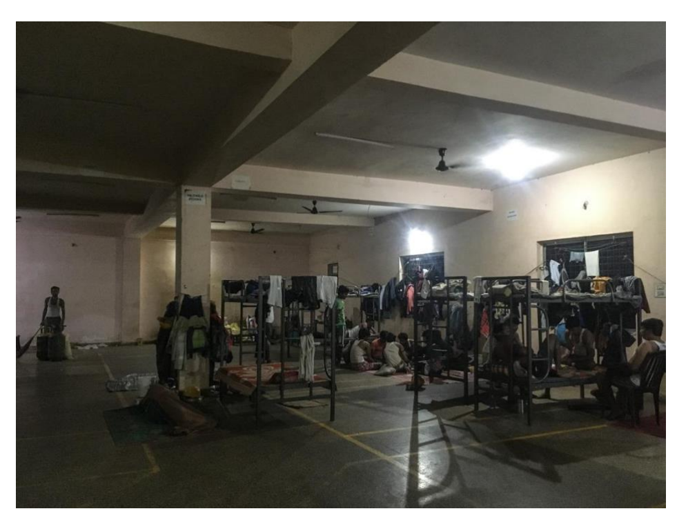
Poor ventilation, congestion and lack of privacy.